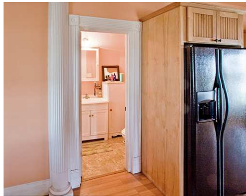
MAIN LEVEL BATH