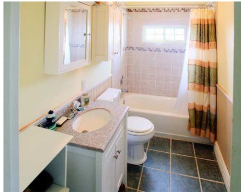
SECOND FLOOR BATH