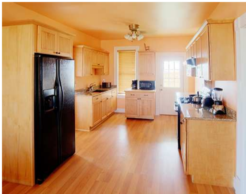
EAT IN KITCHEN