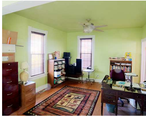
DEN / STUDY / OFFICE