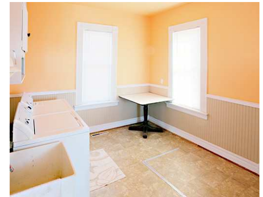
MUD / LAUNDRY ROOM