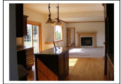
Fam Rm from Kitchen