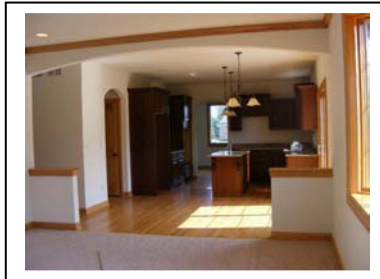
Kitchen from Fam Rm