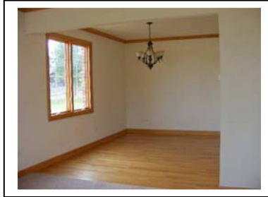
Formal Dining Rm