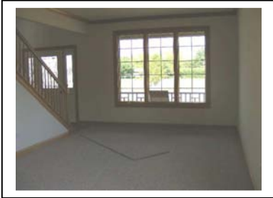
Formal Living Rm