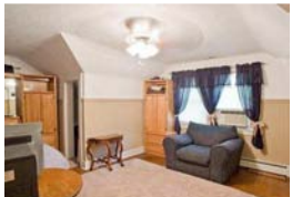
Master Sitting Area