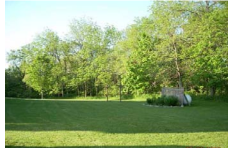
Tree-Lined Back Yard